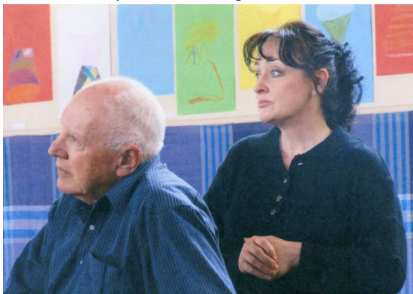
Honestly ,we are.

This is a great cast of I T actors who really enjoy working with each other and it shows in the way the fast moving dialogue exchanges absolutely sparkle. Here are a few pix of me and my mates having fun.